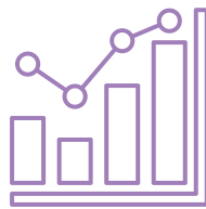
Stocks & Securities