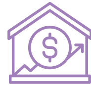
Real Estate Donation