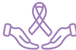
Social Media & Peer-to-Peer Fundraising