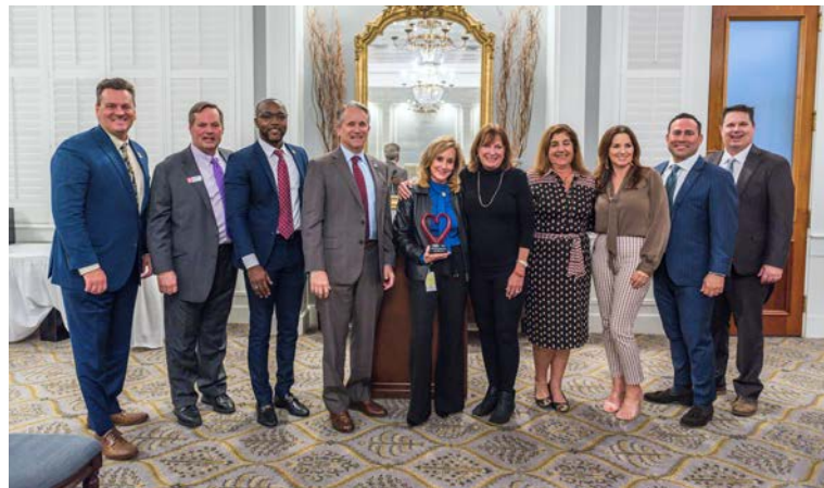
Above: Florida legislators gather in support of Epilepsy Alliance Florida for the annual Purple = Red + Blue reception in Tallahassee.

Annually, we journey to Tallahassee during Florida's legislative session to engage with stakeholders, evaluate policies, and hold the Epilepsy Alliance Florida's prestigious "Purple = Red + Blue" evening reception. At this event, we honor state leaders who have shown unwavering support for both our organization and epilepsy sufferers across the state with our Champion of the Heart Award.